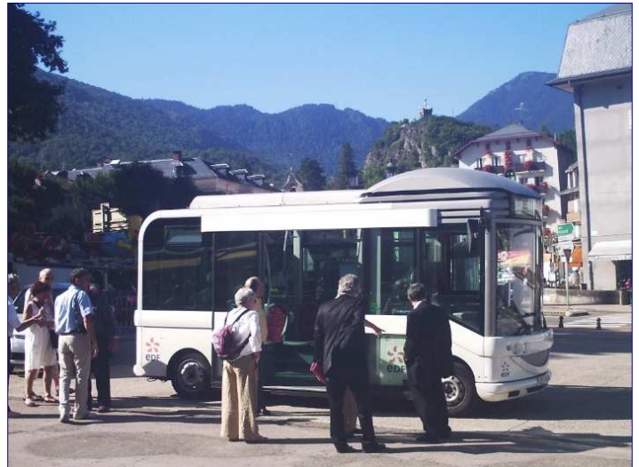
Success during trials at Ax-Les-Thermes...